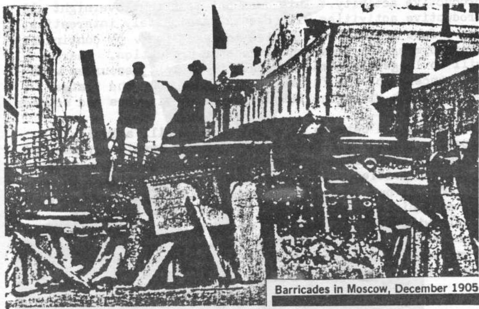
Barricades in Moscow, December 1905

It is a struggle to spread the revolution to all parts of the world, to remove pockets of resistance, to guard against sabotage, and to destroy all remnants of capitalist organisation - that is the structures of the state, parliament, the unions and the various parties which claim to represent the working class.