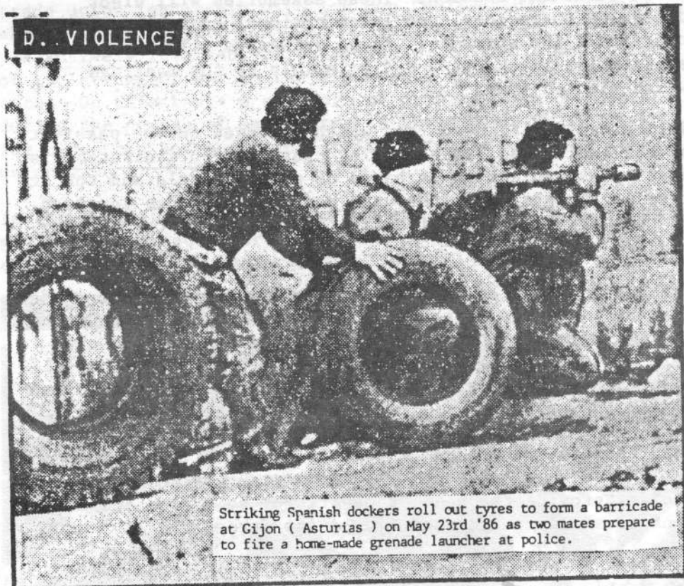
Striking Spanish dockers roll out tyres to form a barricade at Gijon ( Asturias ) on May 23rd '86 as two mates prepare to fire a home-made grenade launcher at police.

The violence inherent to capitalist society will disappear under communism, a society based on the free association of individuals. But the revolution itself will inevitably be a bloody affair. Even the limited struggles of today, for very modest demands, provoke a violent response from the ruling class. But this is only a foretaste of the ferocious violence which the ruling class is already preparing to use against a future revolutionary struggle. At all times - before, during and for as long as is necessary after the revolution - the working class must be prepared to use whatever violence is necessary to drive its struggle forward and seal its victory.